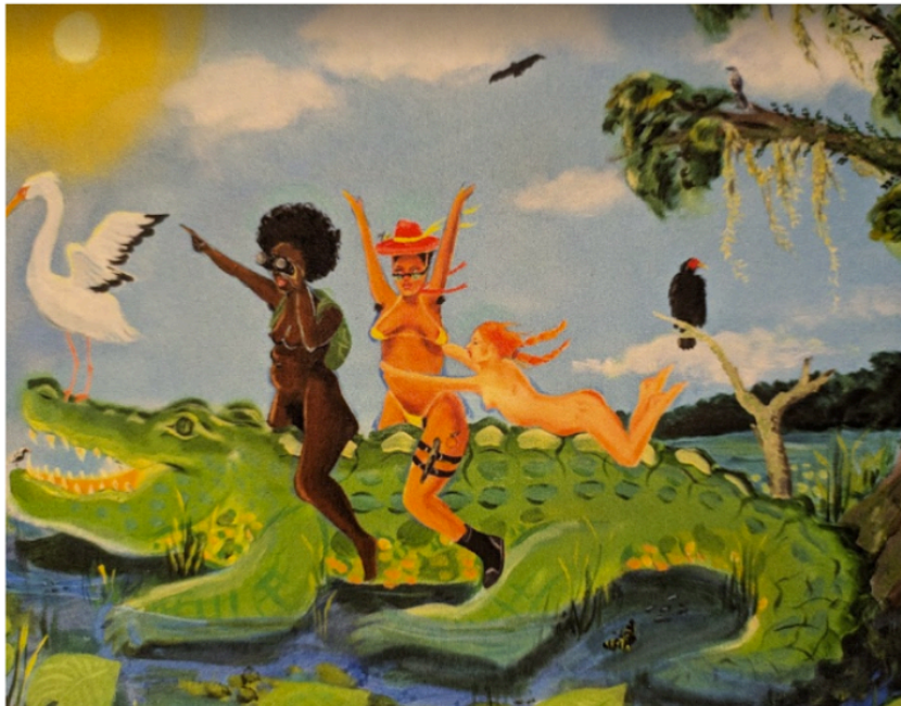
Freedom Begins Where Work Ends, 2020 by Serena Corson Spray paint, acrylic, and oil on canvas, 24 in. x 30 in. Exhibited at Berkeley Art Center 2022 Exhibition: No Way Out But Through