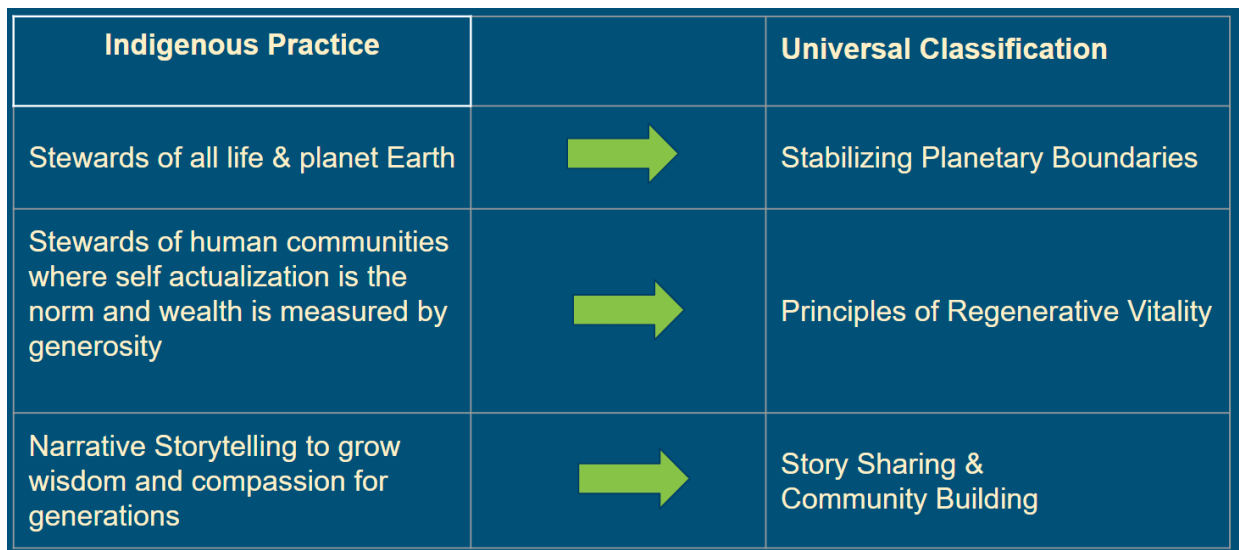
Figure 1: Mapping Indigenous practices for transformation.

The classification's power for providing invaluable insight from labels, overlaid with bioregional data (soil, ground water, geology, temperature, population, biodiversity, political, etc.), is unimaginable with infinite possibilities for each bioregion to customize, iterate, change and create more possibilities!