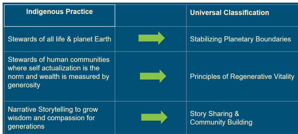
Figure 1: Mapping Indigenous practices for transformation.

Our indigenous ancestors lived for millions of years as stewards of all life and planet, sharing wisdom and growing compassion through generations by sharing narrative stories. A new platform, based on a universal classification system, derived from examining indigenous practices, provides a transformation pathway from our current world to a new modern dream, based on sufficiency and abundance rather than efficiency and scarcity.